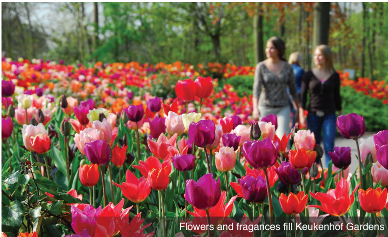
Flowers and fragrances fill Keukenhof Gardens

headquarters for the American military during WWII.