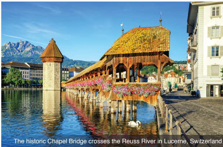
The historic Chapel Bridge crosses the Reuss River in Lucerne, Switzerland