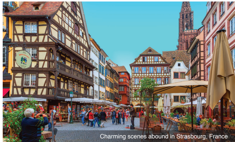
Charming scenes abound in Strasbourg, France

DAY 1 Depart the USA: Today you'll depart the USA on your overnight flight to Zurich, Switzerland.