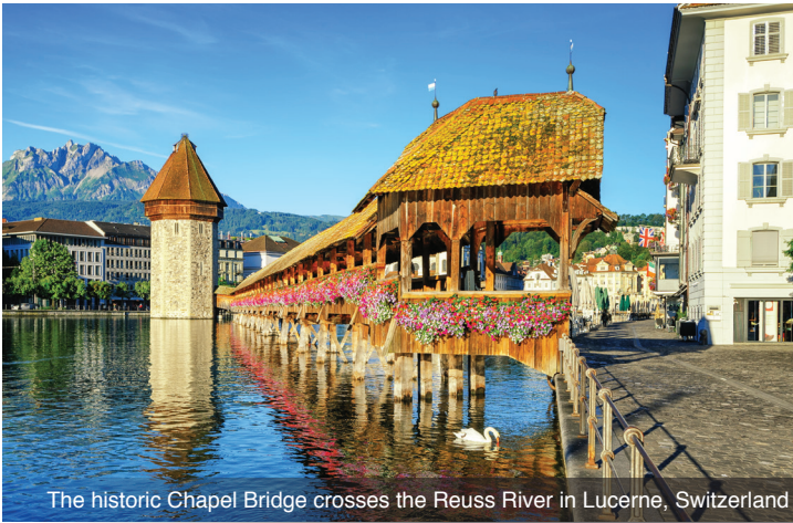
The historic Chapel Bridge crosses the Reuss River in Lucerne, Switzerland