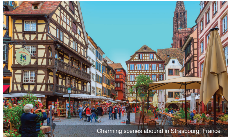
Charming scenes abound in Strasbourg, France

DAY 1 Depart the USA: Today you'll depart the USA on your overnight flight to Zurich, Switzerland.