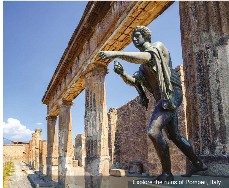
Explore the ruins of Pompeii, Italy

DAY 1 Depart the USA: Depart the USA on your overnight flight to Naples, Italy.