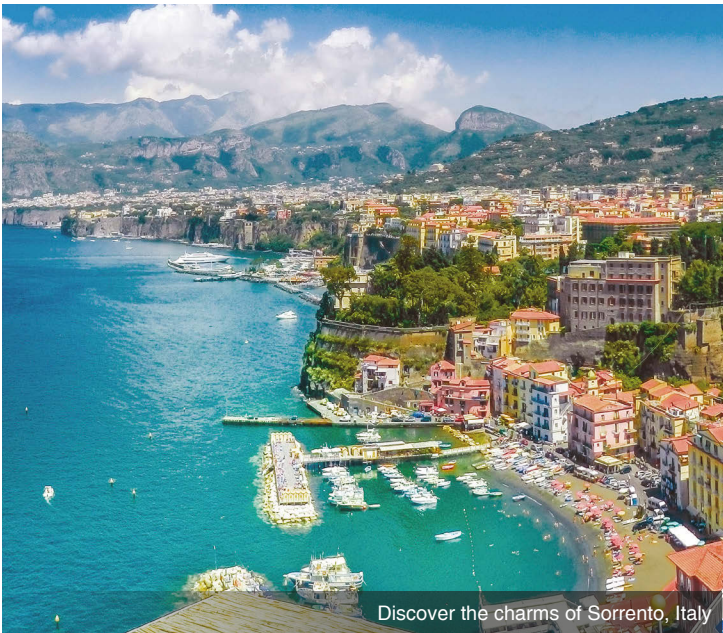
Discover the charms of Sorrento, Italy