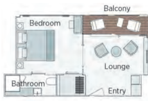
Owner's One-Bedroom Suite