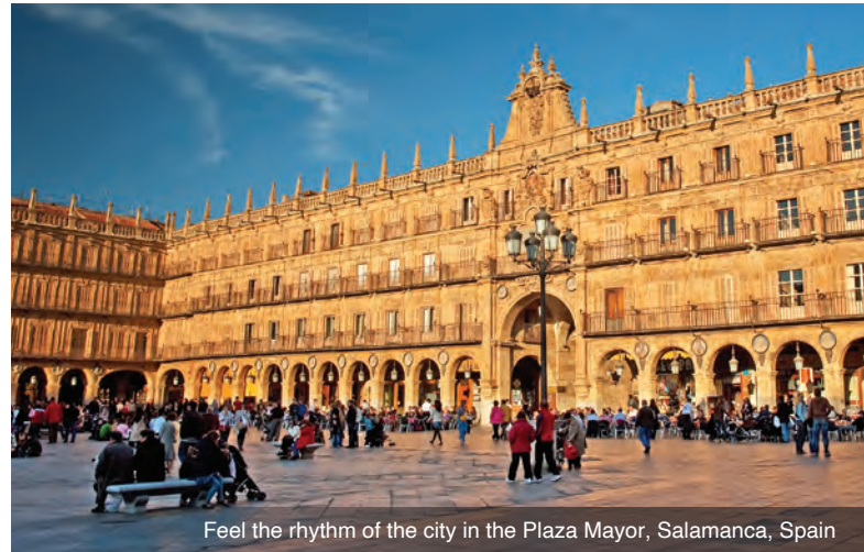
Feel the rhythm of the city in the Plaza Mayor, Salamanca, Spain

DAY 1 Depart the USA: Depart the USA on your overnight flight to Lisbon, Portugal.