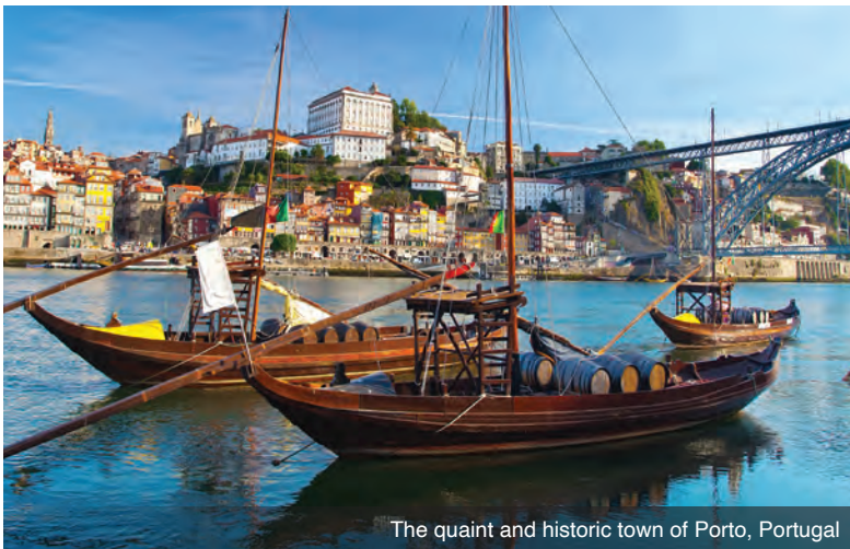
The quaint and historic town of Porto, Portugal

pilgrimage sites in Portugal. Visit the Sanctuary perched atop the hill, with its iconic 686-step granite staircase, decorated with the traditional Portuguese blue and white 'azulejos' tiles. This afternoon, experience a rural lunch at Quinta da Pacheca, one of the finest estates along the Douro River. Return to the ship in Régua after the excursion. This evening, enjoy local entertainment onboard. Meals: B, L, D