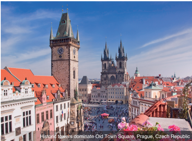
Historic towers dominate Old Town Square, Prague, Czech Republic

guided cycling tour to Danube Island. You can also choose to visit Bratislava with a guided tour through the cobbled streets of the old town. See historic buildings, architectural treasures, and quaint alleyways lined with shops and restaurants.