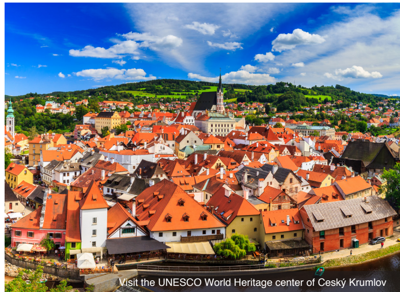
Visit the UNESCO World Heritage center of Český Krumlov

DAY 1 Depart the USA: Depart the USA on your overnight flight to Prague, Czech Republic.