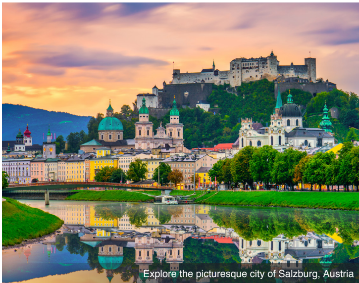
Explore the picturesque city of Salzburg, Austria