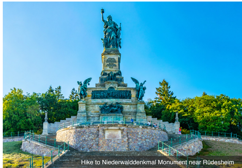
Hike to Niederwalddenkmal Monument near Rüdesheim

DAY 1 Depart the USA: Depart the USA on your overnight flight to Amsterdam, the Netherlands.