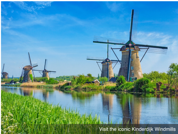
Visit the iconic Kinderdijk Windmills