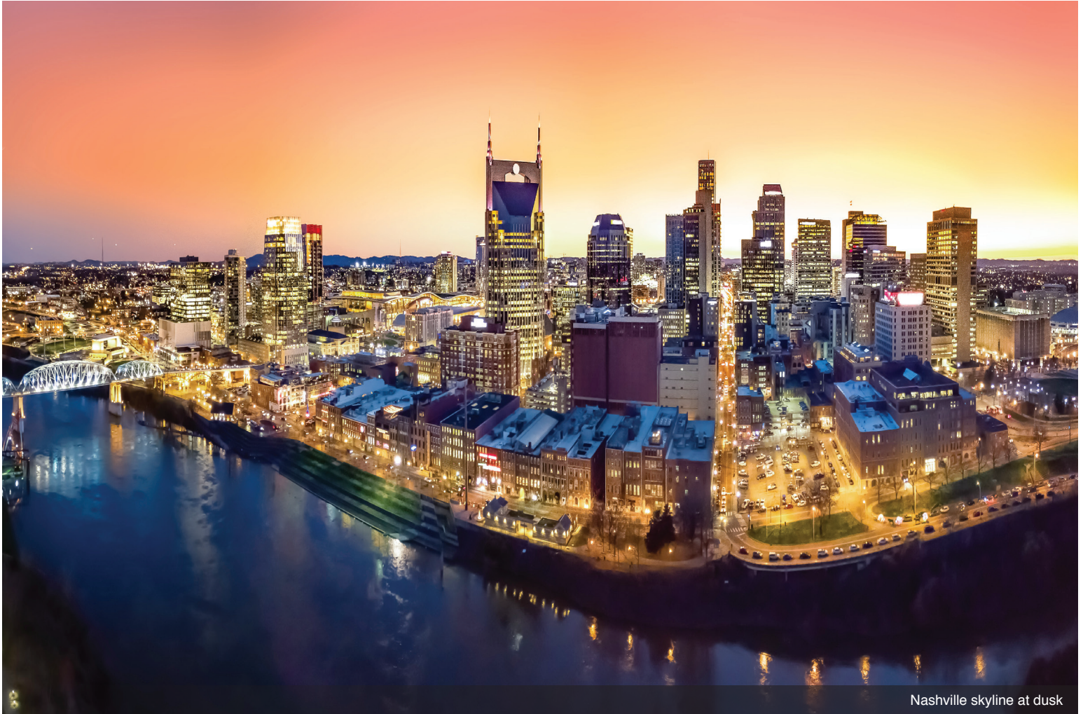
Nashville skyline at dusk