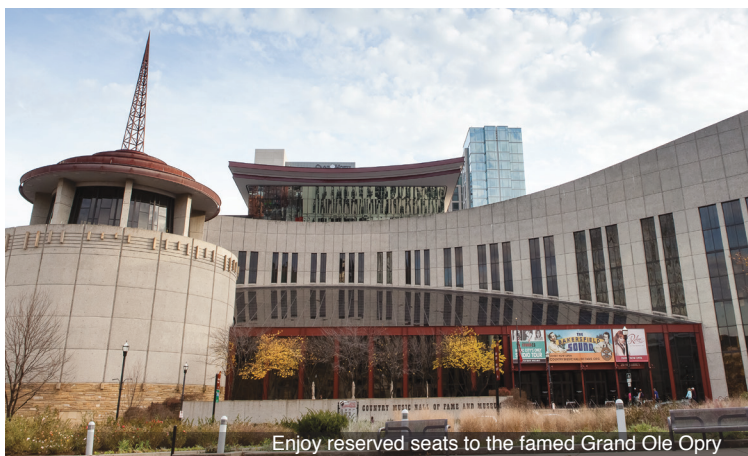
Enjoy reserved seats to the famed Grand Ole Opry

DAY 9 Return Home: After breakfast a group transfer takes you to the Nashville International Airport for flights home departing after 11:00 a.m. Meal: B