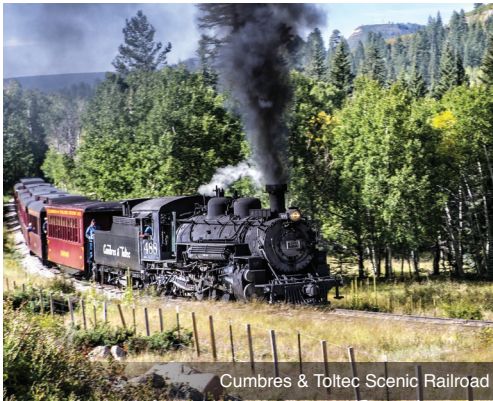
Cumbres & Toltec Scenic Railroad