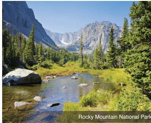
Rocky Mountain National Park