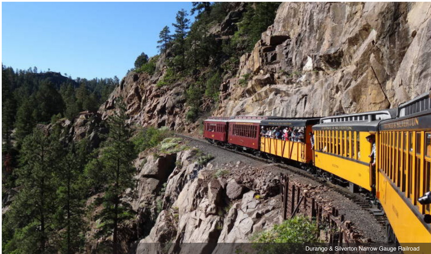
Durango & Silverton Narrow Gauge Railroad

DAY 6 Cumbres & Toltec Scenic Railroad: Your day begins as you board the motorcoach and ride to the Cumbres & Toltec Scenic Railroad, the original Rio Grande Line. This is America's most spectacular narrow gauge steam railroad. Explore 50 miles of wild and rugged territory between Chama, New Mexico and Antonito, Colorado, the highest point on the railroad. Meals: B, L