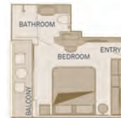
Balcony Suite 205ft 2 Including Scenic Sun Lounge