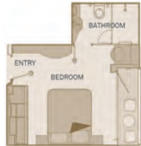
Junior Suite 250ft 2 Including Scenic Sun Lounge