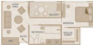
Royal Owner's Suite 520ft 2 Including Scenic Sun Lounge