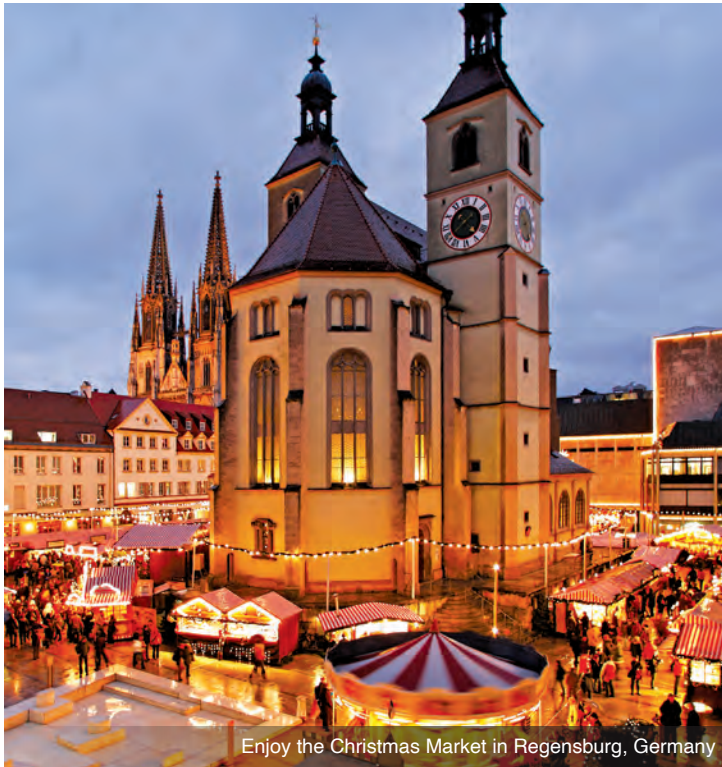
Enjoy the Christmas Market in Regensburg, Germany