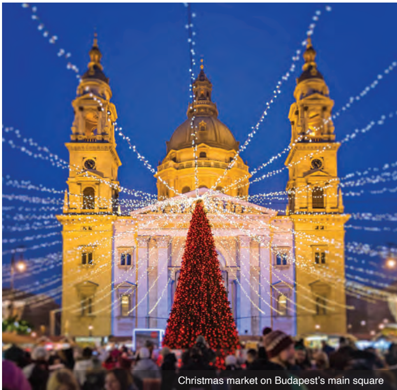
Christmas market on Budapest's main square

crossing the Margaret Bridge to the Pest side where you will see Széchenyi square and Elizabeth square. After your tour, you will have ample free time to explore the Christmas Markets of the city. Alternatively, if you are feeling more active, hike to Buda Hill.