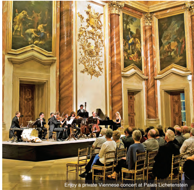
Enjoy a private Viennese concert at Palais Lichtenstein

DAY 1 Depart USA: Depart the USA on your overnight flight to Munich, Germany.