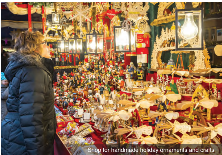
Shop for handmade holiday ornaments and crafts

Days 2 through 9 – Aboard a Scenic Space-Ship