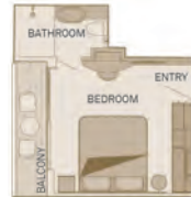
Deluxe Balcony Suite 225ft 2 Including Scenic Sun Lounge