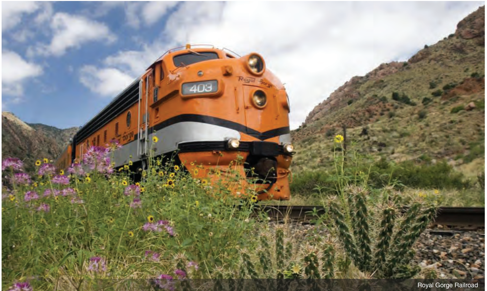
Royal Gorge Railroad