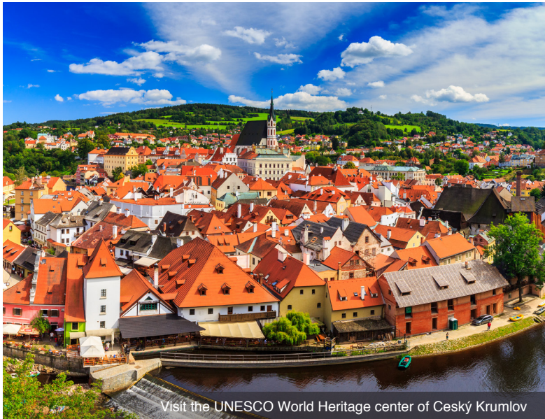
Visit the UNESCO World Heritage center of Český Krumlov

After the included visit to Melk Abbey, choose to join the optional excursion to Schallaburg Castle or enjoy free time in Melk.