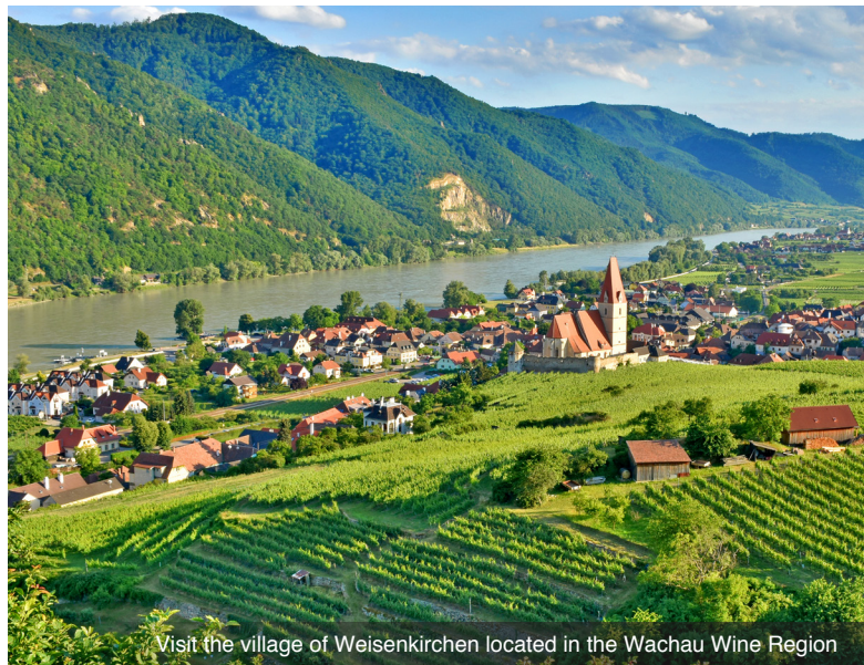
Visit the village of Weisenkirchen located in the Wachau Wine Region

DAY 1 Depart the USA: Depart the USA on your overnight flight to Budapest, Hungary.