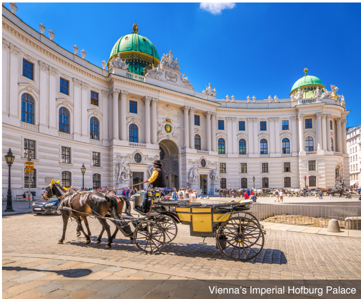
Vienna's Imperial Hofburg Palace