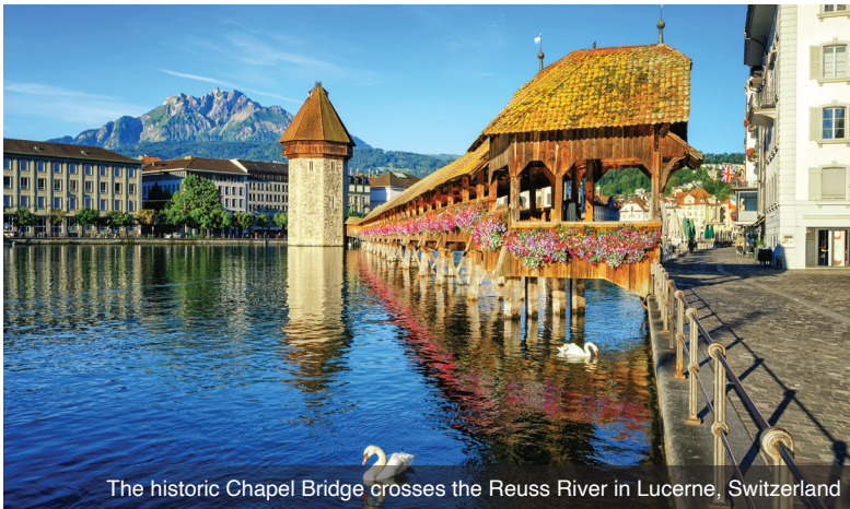
The historic Chapel Bridge crosses the Reuss River in Lucerne, Switzerland

DAY 8 Breisach, Germany: Experience the ‘tale of two cities’: Breisach, Germany and Neuf-Breisach, France, divided by the Rhine. During the guided visit to these two wonderful gems on the Rhine River, you’ll pass the main sights and attractions, including the UNESCO World Heritage fortress overlooking Neuf-Breisach. Meals: B, L, D