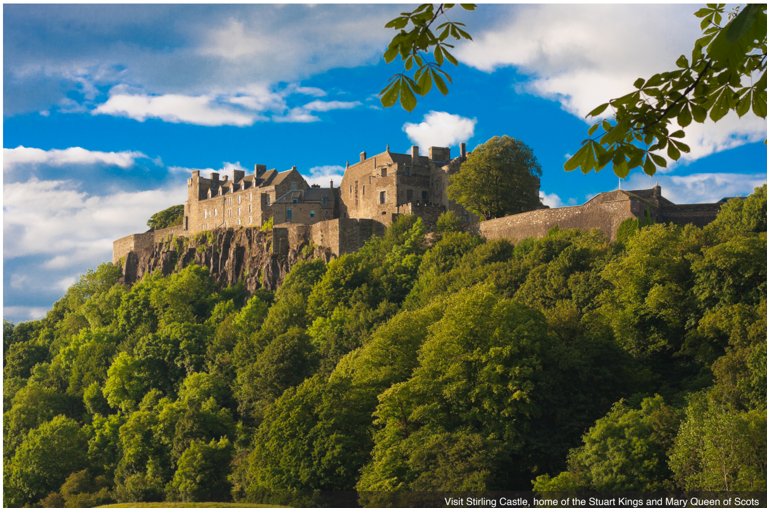
Visit Stirling Castle, home of the Stuart Kings and Mary Queen of Scots