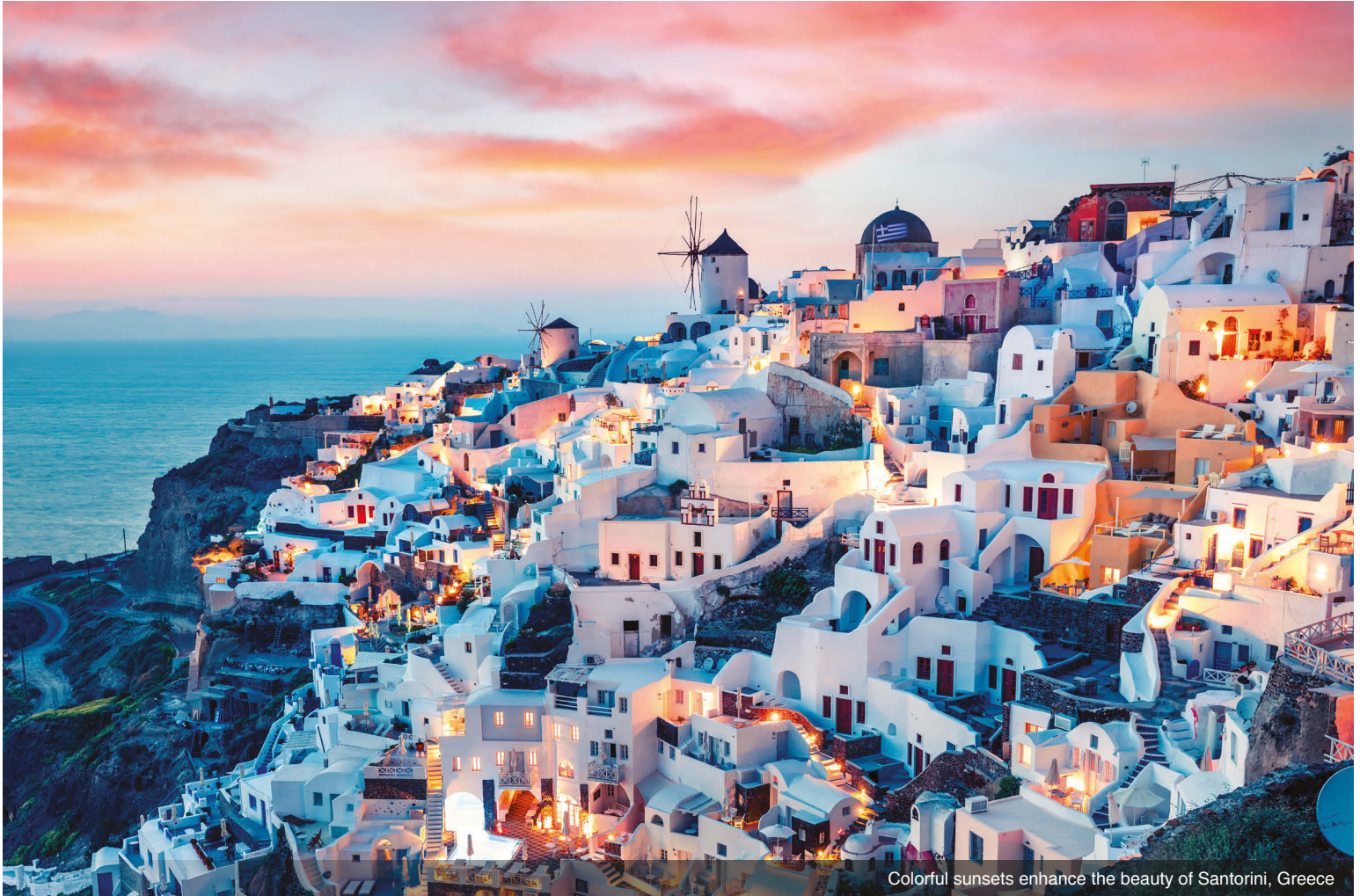
Colorful sunsets enhance the beauty of Santorini, Greece