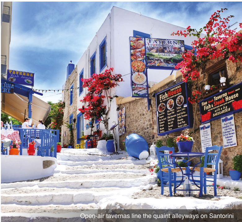
Open-air tavernas line the quaint alleyways on Santorini

remainder of the day at leisure. Browse in the boutiques, visit the beach or simply enjoy people-watching and meeting the locals at a sidewalk café. Meal: B