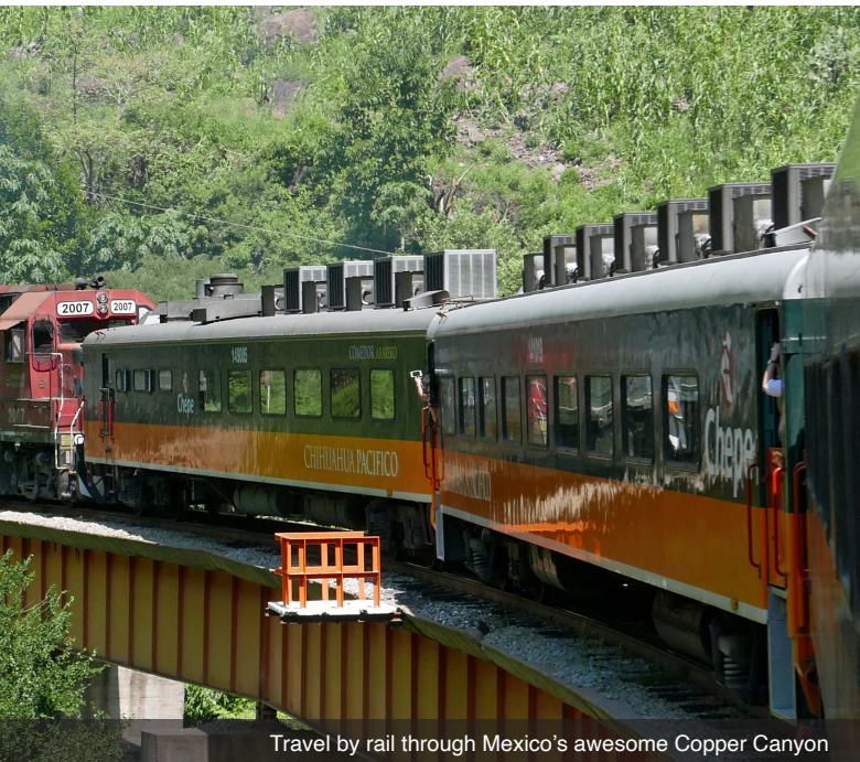
Travel by rail through Mexico's awesome Copper Canyon

A delicious dinner and live performance entertainment brings a close to the day. Meals: B, L, D