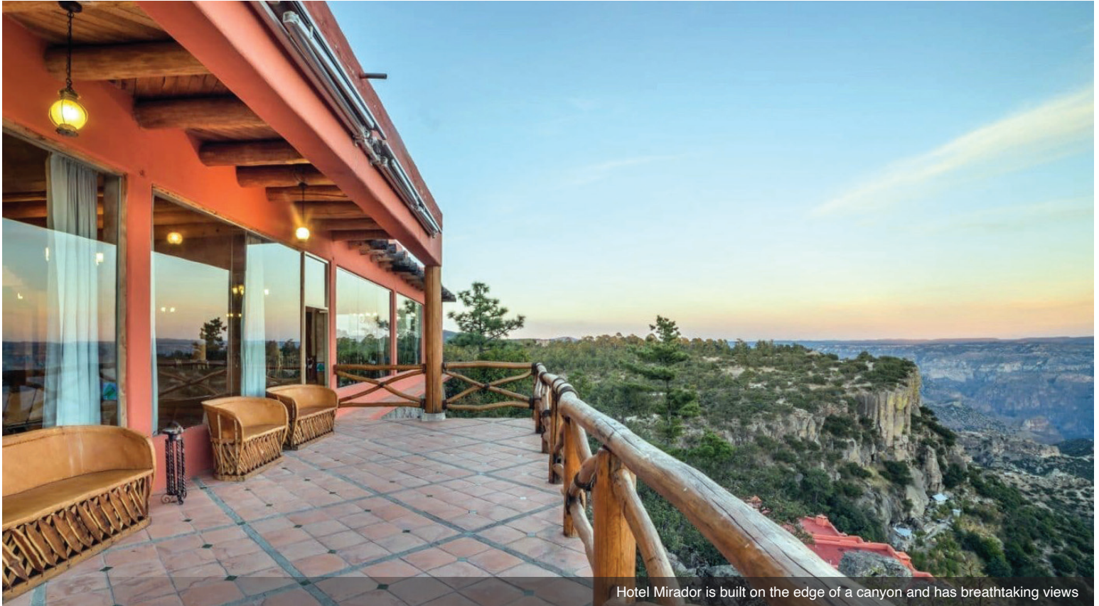
Hotel Mirador is built on the edge of a canyon and has breathtaking views