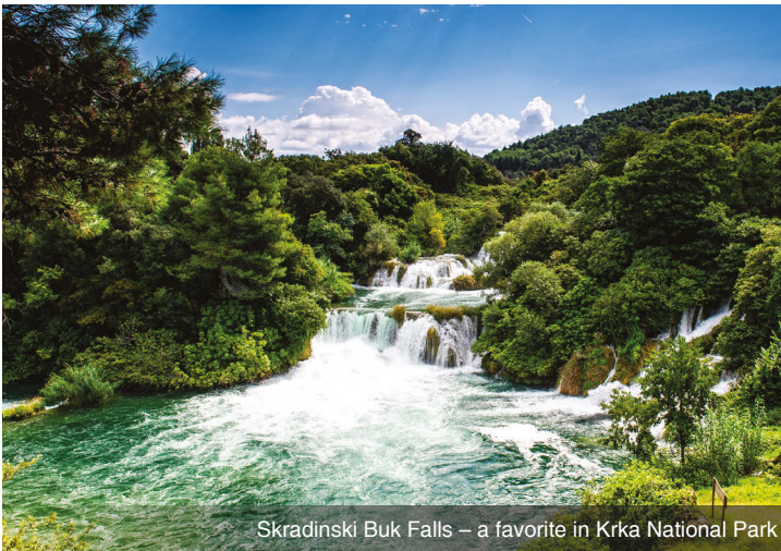
Skradinski Buk Falls – a favorite in Krka National Park