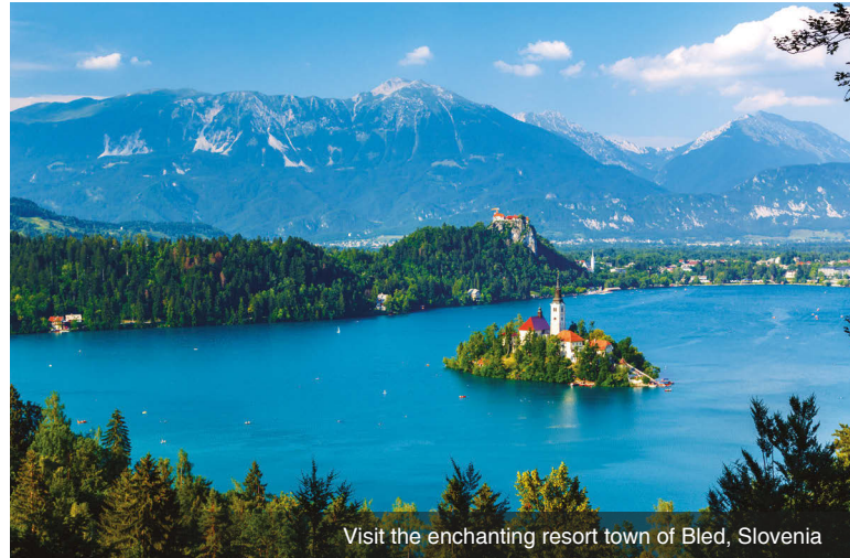
Visit the enchanting resort town of Bled, Slovenia

DAY 1 Depart the USA: Depart the USA on your overnight flight to Dubrovnik, Croatia.