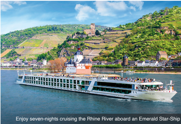
Enjoy seven-nights cruising the Rhine River aboard an Emerald Star-Ship