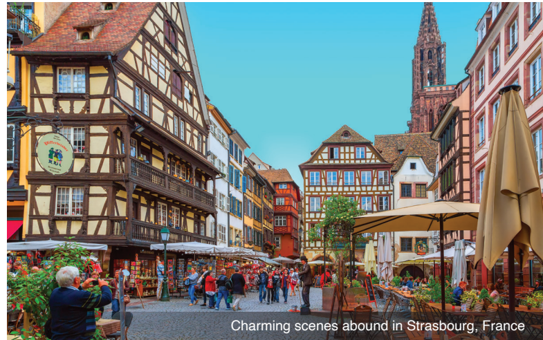
Charming scenes abound in Strasbourg, France

DAY 1 Depart the USA: Depart the USA on your overnight flight to Geneva, Switzerland.