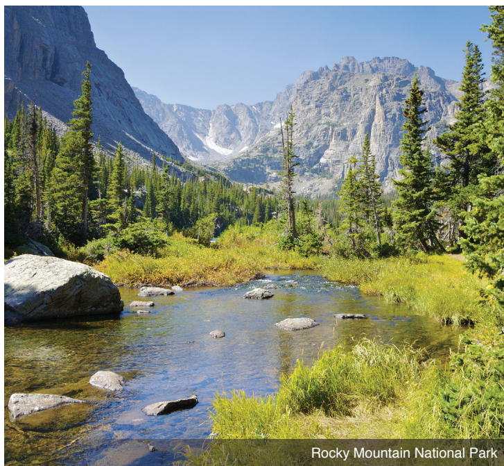
Rocky Mountain National Park