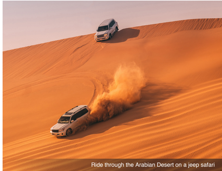
Ride through the Arabian Desert on a jeep safari

DAY 1 Depart the USA: Depart the USA on your overnight flight to Dubai, United Arab Emirates.