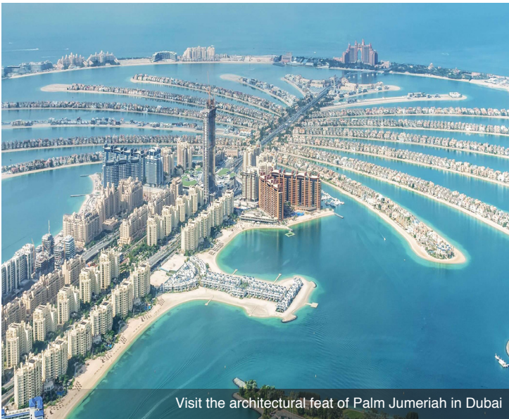
Visit the architectural feat of Palm Jumeriah in Dubai