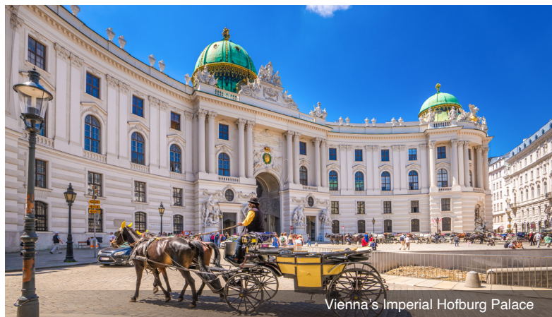
Vienna's Imperial Hofburg Palace

DAY 9 Bratislava, Slovakia: Today you sail into the capital of Slovakia. This graceful nation became an independent country in 1993, and since then, Bratislava has flourished as a new capital and made a name for itself as a cultural center. The romantic cobblestone lanes that weave through the city are explored with your local guide as you enjoy a walking tour of the ancient town center, seeing the Slovak National Theatre and a range of Gothic and Art Nouveau buildings. For the more active guests, embark on a guided hike to Bratislava Castle, a landmark steeped in legends that looks as though it came from the pages of a fairytale book. Meals: B, L, D EmeraldACTIVE: A guided hike to Bratislava Castle (instead of walking tour) DiscoverMORE: Carpathian Wine Route (additional expense) EmeraldPLUS: Local Slovakian entertainment onboard