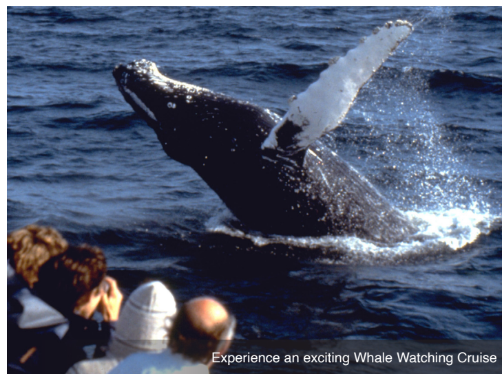
Experience an exciting Whale Watching Cruise

DAY 8 Travel Home: After breakfast, your group transfer brings you to Boston's Logan Airport for flights out after 12:00 p.m. Meal: B