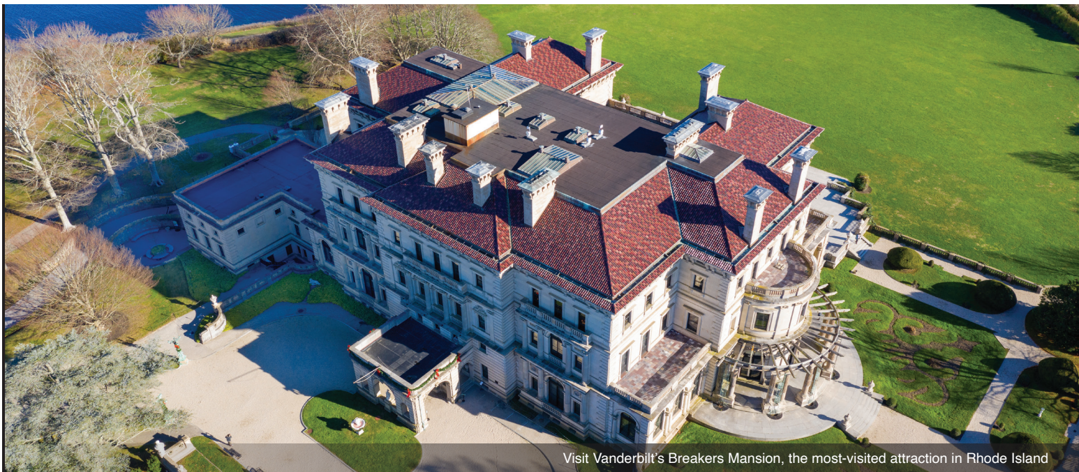
Visit Vanderbilt's Breakers Mansion, the most-visited attraction in Rhode Island

homes built here during America's glamorous "Gilded Age." Visit Vanderbilt's Breakers Mansion and the impressive Marble House to get a glimpse of how America's most elite families lived at the turn of the century. Meals: B, L