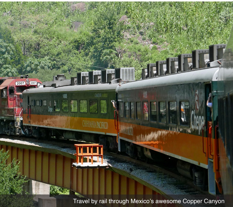
Travel by rail through Mexico's awesome Copper Canyon

A delicious dinner and live performance entertainment brings a close to the day. Meals: B, L, D