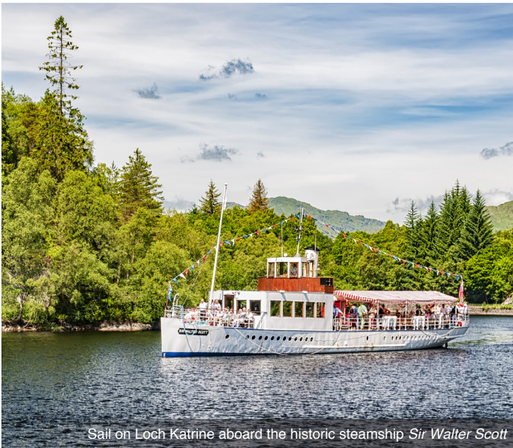
Sail on Loch Katrine aboard the historic steamship Sir Walter Scott