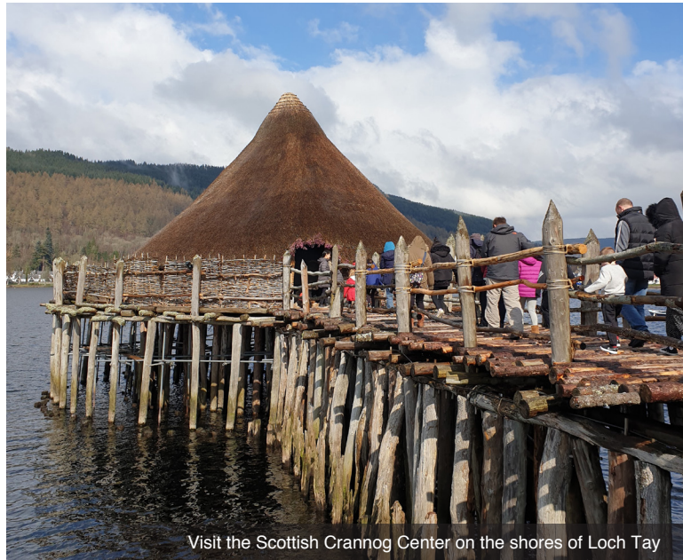
Visit the Scottish Crannog Center on the shores of Loch Tay

DAY 1 Depart the USA: Depart your gateway city on an overnight flight to Glasgow, Scotland.