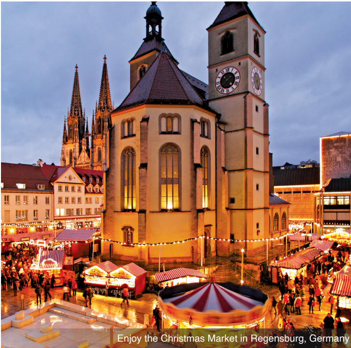
Enjoy the Christmas Market in Regensburg, Germany