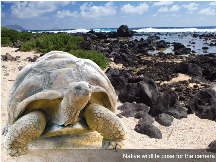
Native wildlife pose for the camera