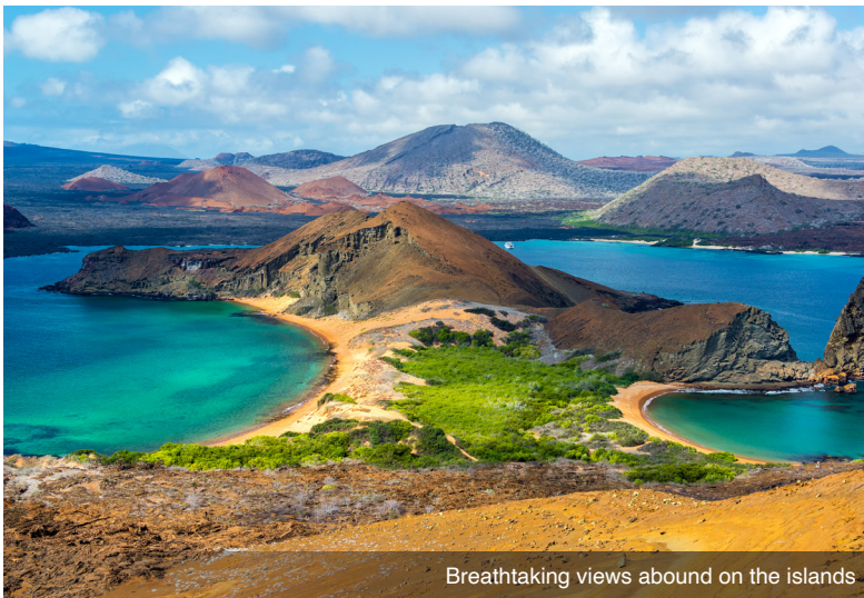
Breathtaking views abound on the islands

on Fernandina Island, one of the most well-preserved of the Galápagos Islands. Discover one of the world's most pristine island ecosystems as you observe hundreds of prehistoric marine iguanas sunbathing on black lava rocks. Quiet now as you encounter flightless cormorants on their nesting site, the only place in the world to find this species. These birds once flew, but over time, adapted to their environment and lost their ability to fly. Be on the lookout for the major predator on the island, the Galápagos hawk. This afternoon, visit Vicente Roca Point. This is a marine-only visitor site with great opportunities for deep-water snorkeling. See plenty of red-lipped batfish, sea horses, frogfish, marine turtles, sunfish, nudibranchs and octopi in these waters. On a dinghy ride along the coast, observe brown pelicans, penguins, flightless cormorants, nazca and blue-footed boobies, all ready to pose for pictures! Meals: B, L, D