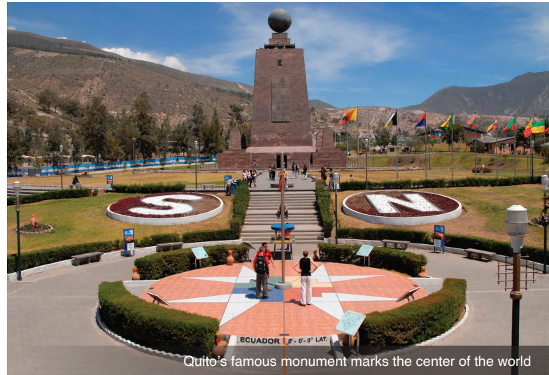
Quito's famous monument marks the center of the world

DAY 1 Depart the USA: Depart the USA on a flight to Quito, Ecuador. Upon arrival, you'll be met by a representative of Mayflower Cruises and Tours and assisted with the transfer to the hotel. Enjoy the remainder of the evening to experience this amazing city on your own.