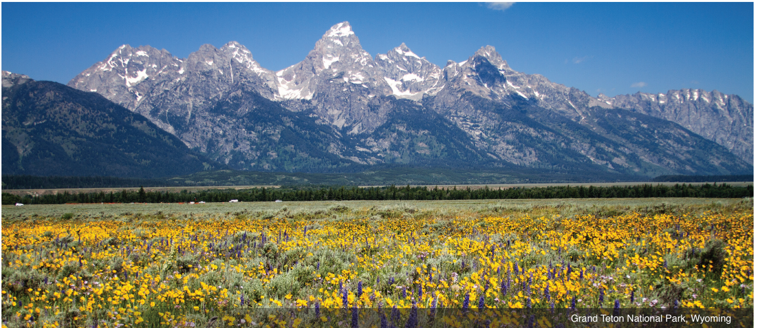
Grand Teton National Park, Wyoming

geysers, and hot springs. Then, head for storied Old Faithful geyser, named for its regular eruptions about every 80 to 90 minutes for some 150 years, before returning to your park lodge. Meal: B