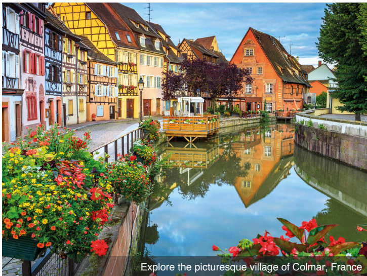
Explore the picturesque village of Colmar, France