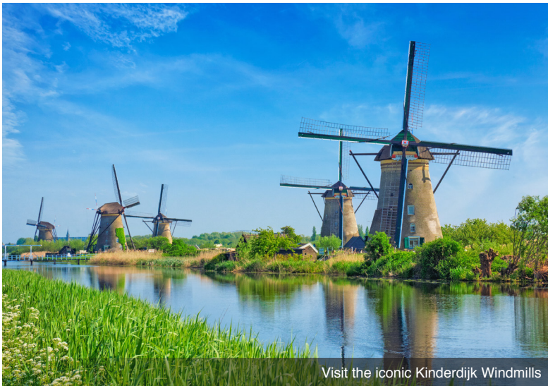
Visit the iconic Kinderdijk Windmills

DAY 9 Koblenz: Wonderfully maintained inside and out, Marksburg Castle boasts a selection of typical interiors including the castle kitchen, the knight's hall, the armoury and an inviting wine cellar. The attractive light-stoned walls of the castle are protected by an outer fortress. With a single tower peering over the turrets and castle walls, it resembles something you would find in a Brothers Grimm tale. Meals: B, L, D