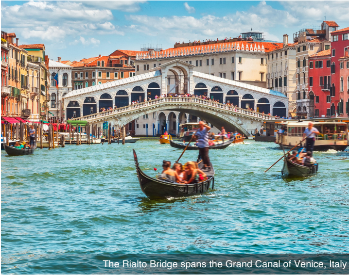
The Rialto Bridge spans the Grand Canal of Venice, Italy