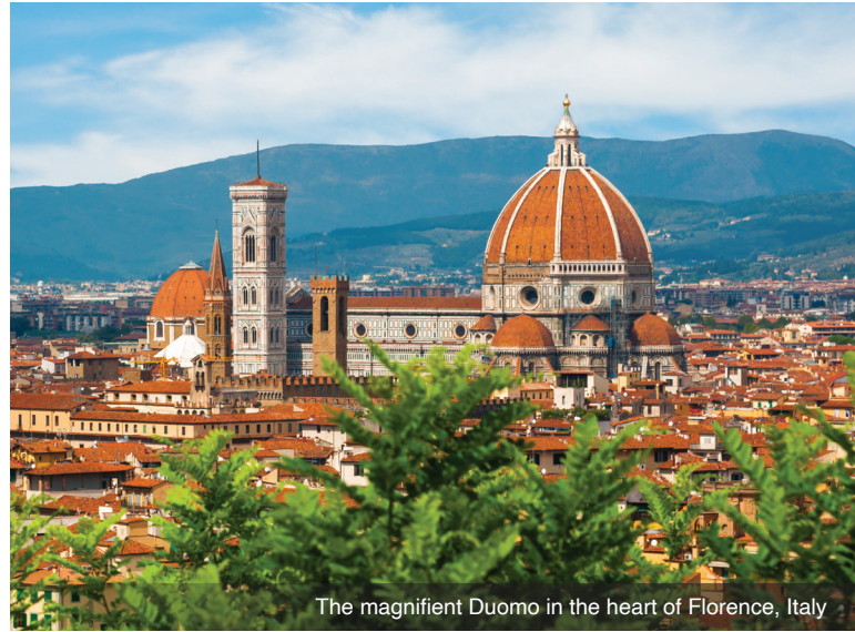
The magnificent Duomo in the heart of Florence, Italy

DAY 1 Depart the USA: Depart the USA on your overnight flight to Venice, Italy.