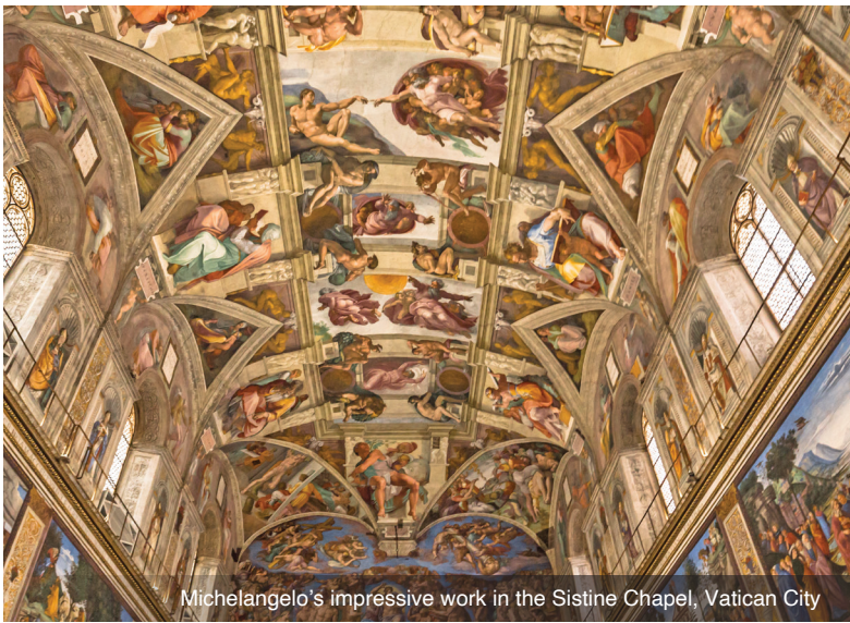
Michelangelo's impressive work in the Sistine Chapel, Vatican City

DAY 7 Montecatini – Florence – Rome: Leaving the resort town of Montecatini, return to Florence by coach and board a high-speed train for the journey to Rome. With a history spanning more than 2,500 years, Rome offers a breathtaking overview of the highlights of Western civilization. From the remarkable Coliseum to the gorgeous Trevi Fountain, this bustling metropolis invites you to imagine life centuries ago as you gaze upon memorials to ancient civilizations. Upon arrival, enjoy a panoramic tour of the city and a guided visit to the Coliseum. Built between 70-80 AD, the Coliseum is considered one of the greatest works of Roman architecture and engineering, and remains the largest amphitheater in the world. The tour ends at the hotel. Meal: B