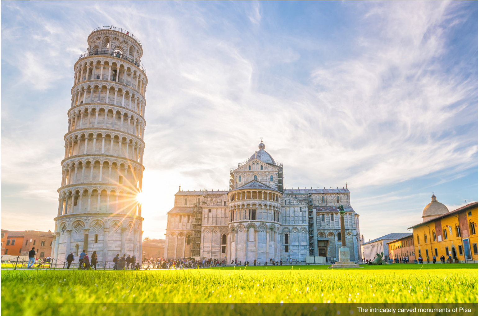
The intricately carved monuments of Pisa