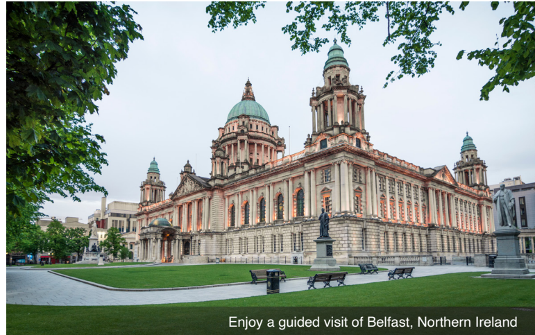
Enjoy a guided visit of Belfast, Northern Ireland

DAY 1 Depart the USA: Depart the USA on your overnight flight to Dublin, Ireland.