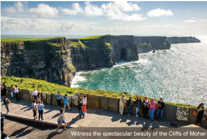
Witness the spectacular beauty of the Cliffs of Moher