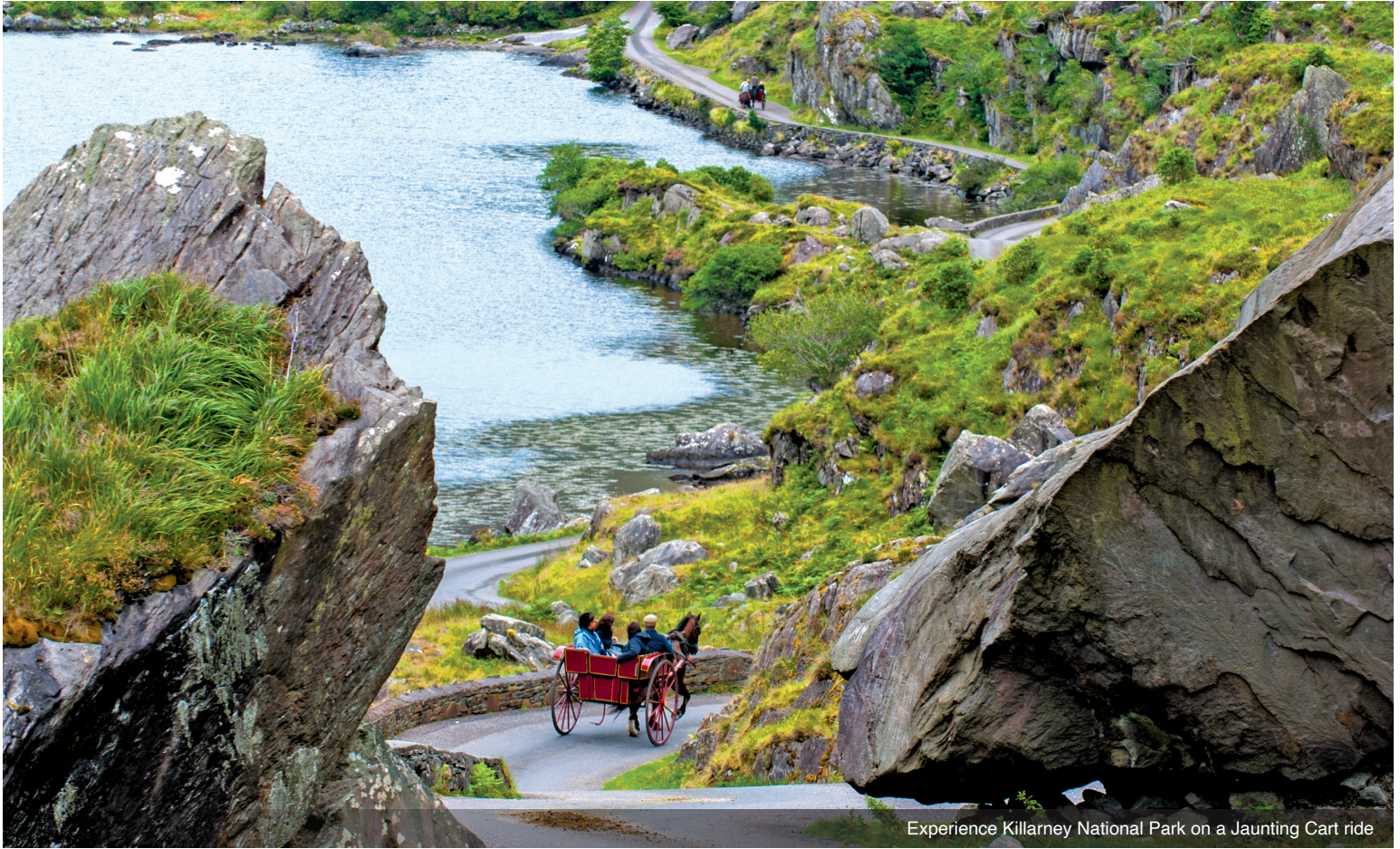
Experience Killarney National Park on a Jaunting Cart ride