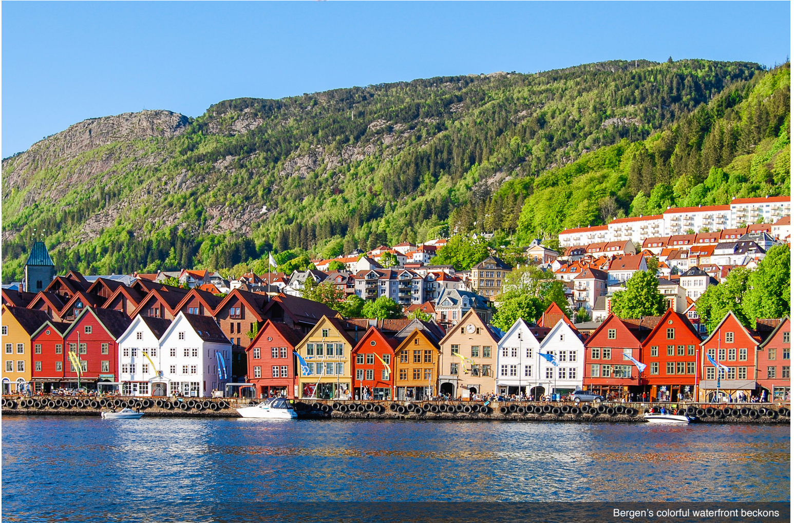
Bergen's colorful waterfront beacons