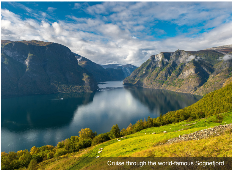
Cruise through the world-famous Sognefjord

World Heritage City, Bergen proudly preserves its rich past, seen in the timbered 15th-century houses, centuries-old warehouses built by seagoing merchants, and a charming labyrinth of cobblestone streets. Nearby, you'll visit Trolldhaugen, the former home and estate of one of Norway's most famous sons, composer Edvard Grieg. The remainder of the day is free to explore this charming city on your own. Meal: B