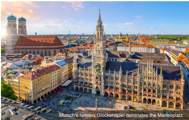
Munich's famous Glockenspiel dominates the Marienplatz

DAY 8 Regensburg: A morning arrival in Regensburg brings you to one of Germany's best-preserved medieval cities and home to one of the oldest bridges crossing the Danube. As a local guide leads you through cobblestone lanes on a walking tour, discover the UNESCO World Heritage old town and see many of the city's architectural highlights. Alternatively, join a bike tour to the Walhalla Monument, towering high above the slopes of the Danube. The site affords a fascinating view of the surrounding landscape and the river below. This evening, enjoy a traditional Bavarian band onboard. The ship remains docked in Regensburg overnight. Meals: B, L, D EmeraldPLUS: Walking tour of Regensburg with Bavarian sausage tasting DiscoverMORE: Nuremberg City Tour (additional expense) EmeraldACTIVE: Bike tour to Walhalla Monument (instead of included tour) EmeraldPLUS: Traditional Bavarian Band onboard