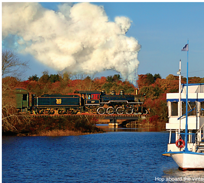
Hop aboard the vintage

DAY 1 Arrive in Boston: Arrive in Boston, Massachusetts with an included transfer to your hotel. Meet your Tour Manager in the hotel lobby at 6:00 p.m. for a welcome dinner. Meal: D