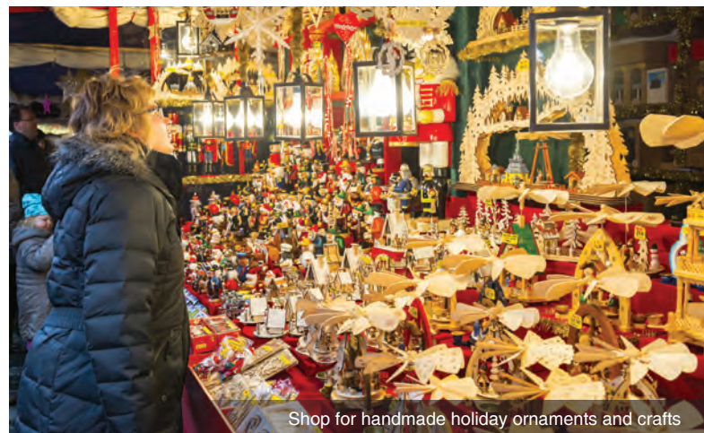
Shop for handmade holiday ornaments and crafts

Days 2 through 8 – Aboard an Emerald Cruises Star-Ship