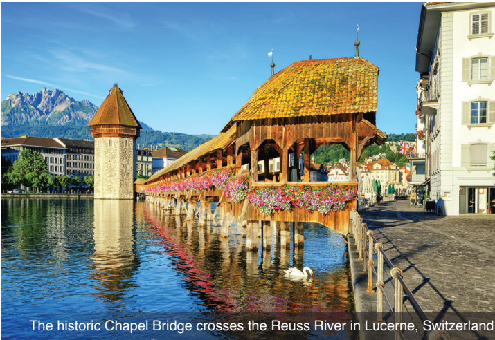
The historic Chapel Bridge crosses the Reuss River in Lucerne, Switzerland