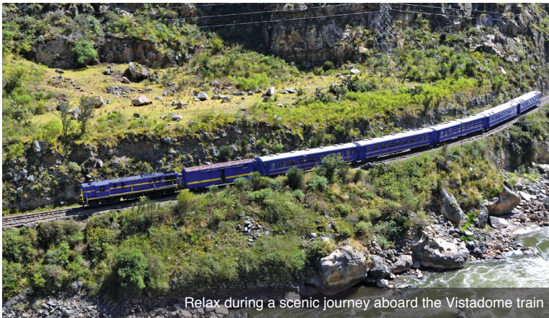
Relax during a scenic journey aboard the Vistadome train

Koricancha and dedicated to the Sun God. The entire valley is filled with architectural wonders around every vista! Continue to Sacsayhuaman, a gigantic walled city and monumental former royal fortress. This former ceremonial compound is a magnificent example of Inca military power and boasts an amazing panoramic view of Cusco. After the excursion, the afternoon is at leisure before an included dinner with entertainment at a local restaurant. Meals: B, D