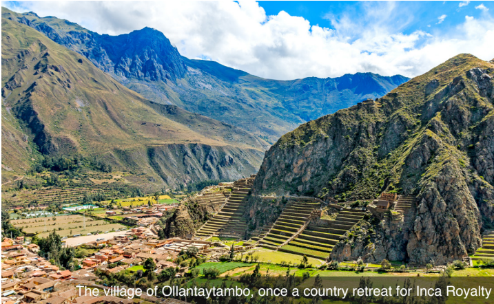
The village of Ollantaytambo, once a country retreat for Inca Royalty