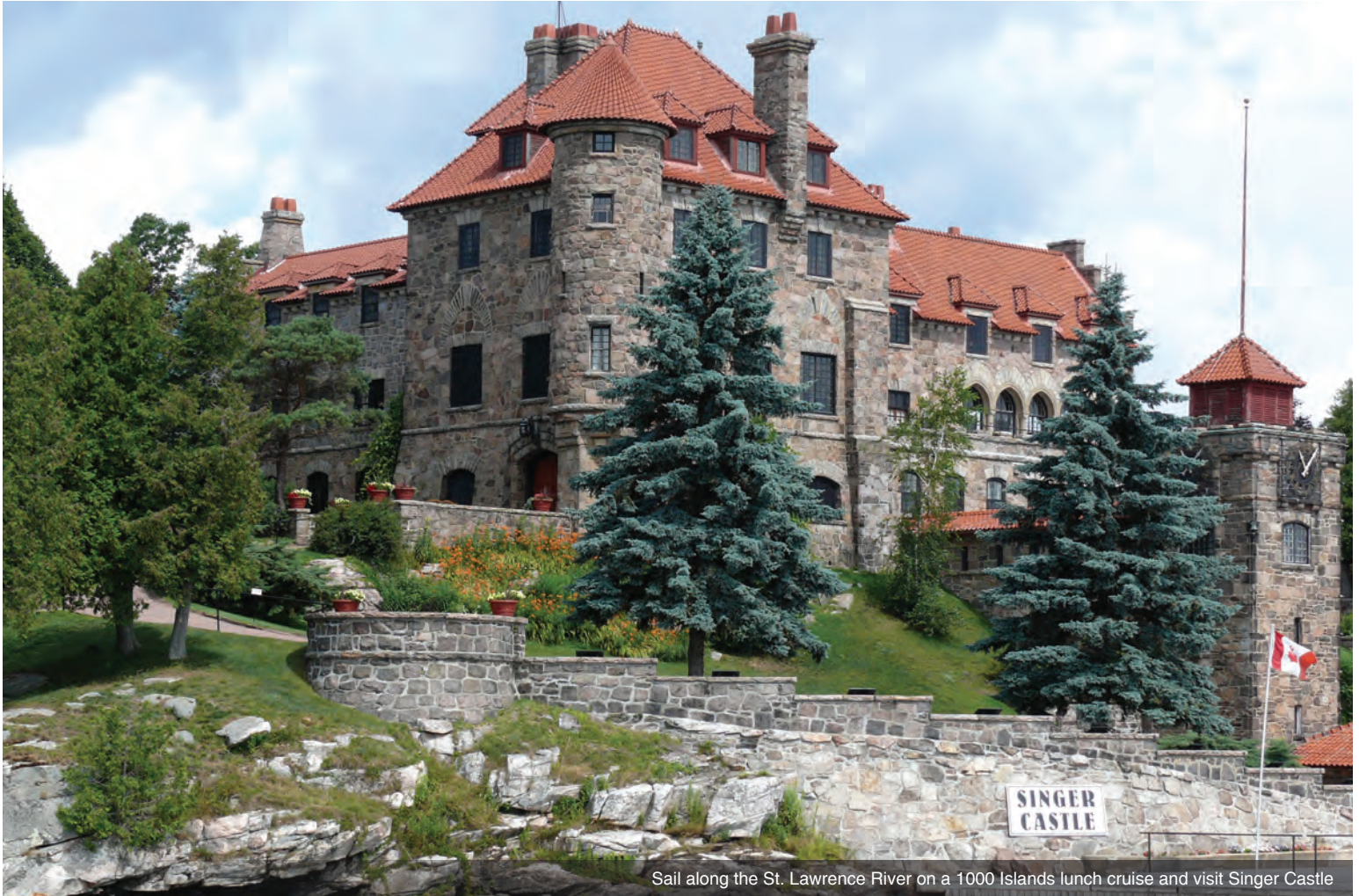
Sail along the St. Lawrence River on a 1000 Islands lunch cruise and visit Singer Castle