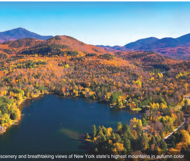
scenery and breathtaking views of New York state's highest mountains in autumn color