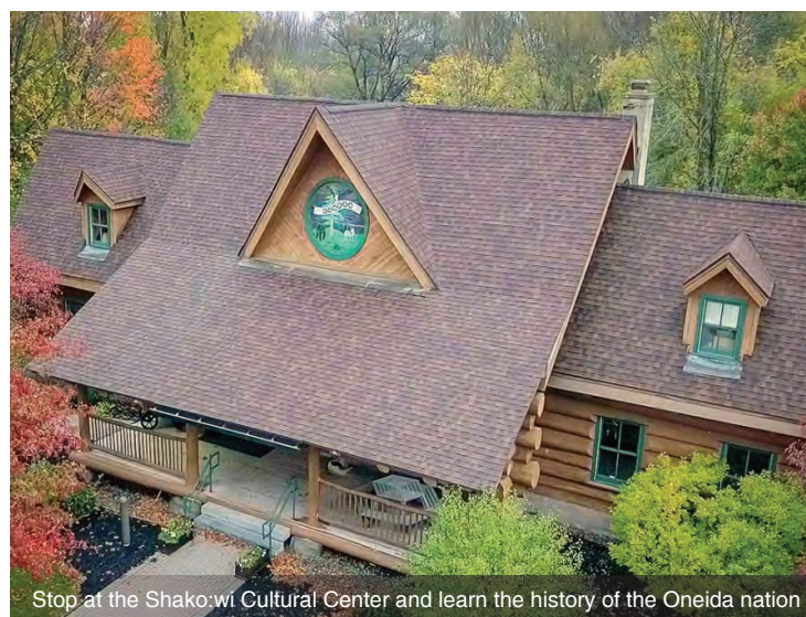
Stop at the Shako:wi Cultural Center and learn the history of the Oneida nation

DAY 8 Return Home: This morning a group transfer to the Syracuse Hancock International Airport for flights out after 12:00 p.m. Meal: B