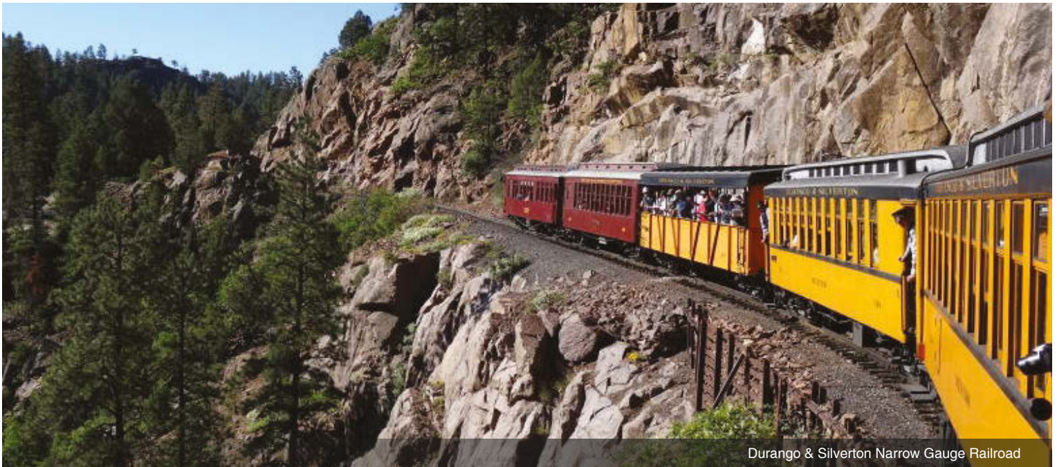
Durango & Silverton Narrow Gauge Railroad

DAY 6 Cumbres & Toltec Scenic Railroad: Your day begins as you board the motorcoach and ride to the Cumbres & Toltec Scenic Railroad, the original Rio Grande Line. This is America's most spectacular narrow gauge steam railroad. Explore 50 miles of wild and rugged territory between Chama, New Mexico and Antonito, Colorado, the highest point on the railroad. Meals: B, L