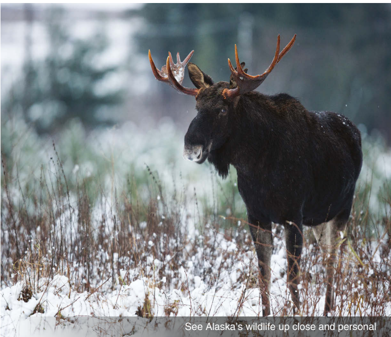
See Alaska's wildlife up close and personal

stop at a local grocery store in Wasilla to pick-up on own snack and lunch items. Prepare for a bit of a walk to find the perfect spot along the fence line of the race. Musher's take off across Willow Lake on their 1,049-mile journey by dog sled to Nome. The Willow Community Center is open and offers a break from the cold with vendors selling food and drink as well as local crafts. Don't miss out on snacks throughout the day! Your Tour Director will have more information on this edible portion of the program! The departure time from Willow will depend on weather conditions and guests' comfort level. It is our goal to see as many of the Musher's depart as possible while still arriving back into Anchorage by 6:00/6:30pm. Upon returning to Anchorage it will be time to say goodbye to your local Tour Manager as you are transferred to the Anchorage Airport for your evening flight. Meal: B