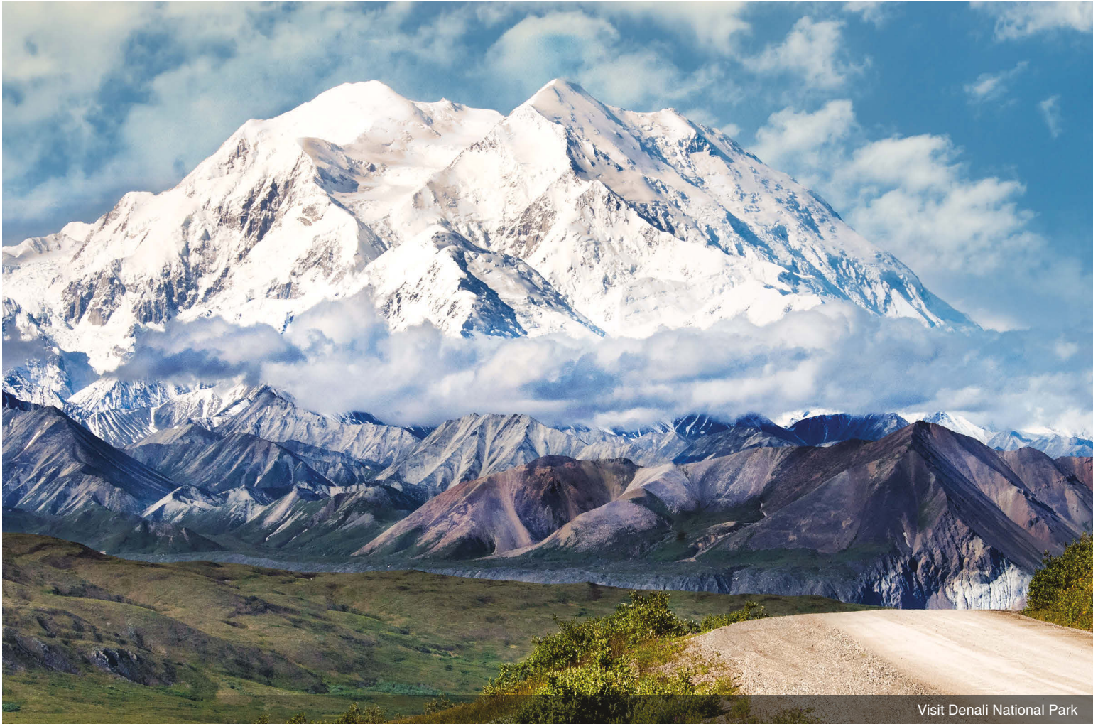
Visit Denali National Park