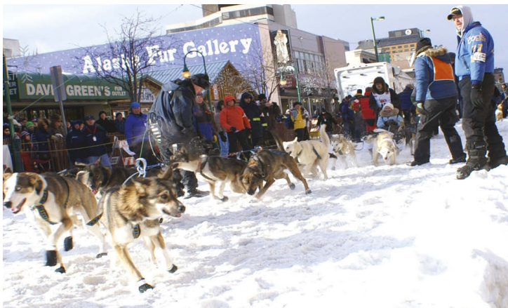
See the Ceremonial Start of the Iditarod Trail Sled Dog Race in Anchorage

DAY 9 Return Home: Arrive home from your overnight flight.