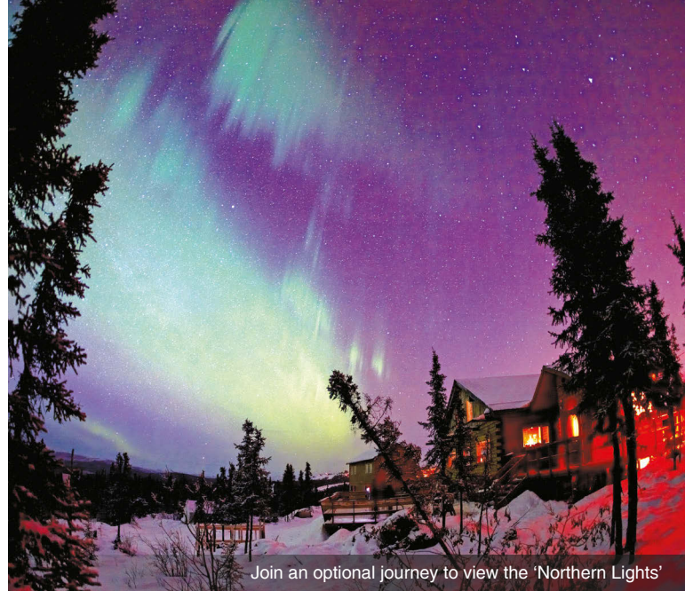
Join an optional journey to view the 'Northern Lights'

DAY 1 Arrive in Alaska: Welcome to Alaska as you arrive in Fairbanks, the Golden Heart City and transfer to your hotel. Meet your Tour Manager in the lobby for dining suggestions. This evening an optional journey is available for some Aurora Borealis viewing.