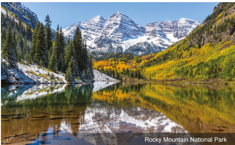
Rocky Mountain National Park

Days 5 and 6 – Hilton Garden Inn, Denver, Colorado