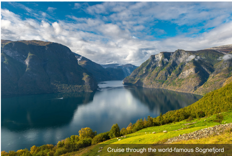
Cruise through the world-famous Sognefjord

cobblestone streets. Nearby, you'll visit Fantoft Stave Church, an example of unique wooden Medieval architecture. Characterized by the 'staves' (thick wooden posts), these traditional churches were constructed without the use of nails or glue, but relied on the expertise of local craftsmen creating joints to hold the structure together. Once housing more than 1000 stave churches, only 28 remain in Norway today. The remainder of the day is free to explore this charming city on your own. Meal: B